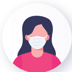
Wear a Mask

At this moment in time, fully vaccinated individuals are encouraged and requested to participate in voluntary scheduled COVID-19 screenings and maintain preventative measures.