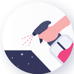
Sanitize Shared Surfaces